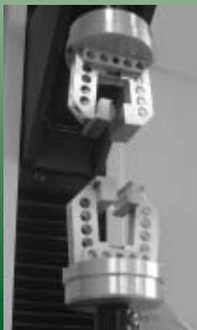
Grip Reference HT58