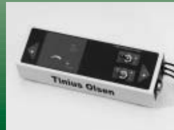
Grip Reference HT400

Description: Pneumatic bollard "Horn" type grips. Bollard reduces stress concentration on test specimen to avoid a grip induced break.