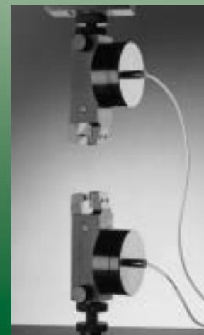
Grip Reference HT44

Description: Light weight low gripping pressure pneumatic vice grips. Ideally suited for use with low force capacity loadcells. Unique line contact jaw solution delivers maximum gripping pressure while minimizing premature grip breaks.