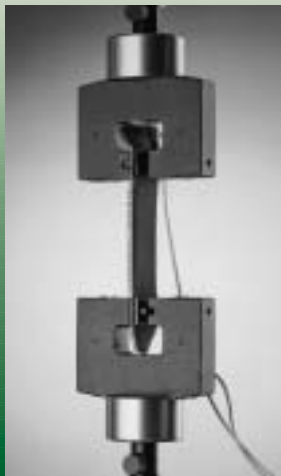
Grip Reference HT45